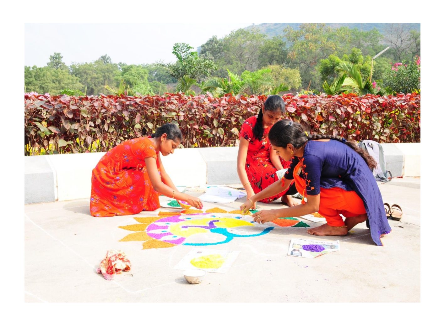
KOLATAM for girl students on the occation of sankranthi sambaralu on 11th JAN, 2020